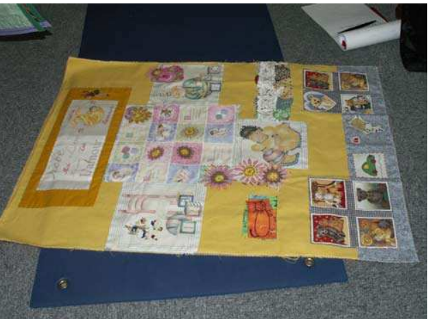
Childbirth and story telling quilts