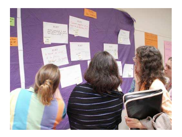
Shopping for a topic at the Open Space

15 discussion topics were chosen and covered during the two days: